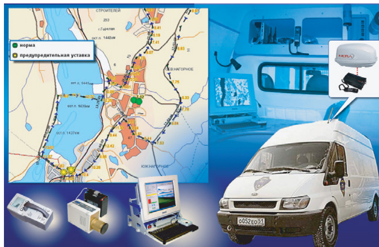
Figure 3. Mobile Radiation Laboratory (MRL). A fragment of data transferred from MRL.