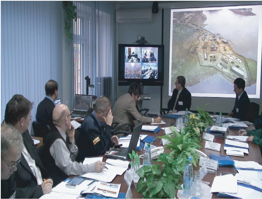
Figure 4. Emergency State Commission at work during the exercise.

25 gamma-radiation dose rate sensors of the Kola NPP ARMS are located in the 30-km control area. The measurement data are transmitted on-line to the Crisis Centre of “Rosenergoatom” Concern, SCC of Rosatom and TCC of IBRAE RAN. On the Concern’s “Rosenergoatom” initiative, the ARMS of the Kola NPP surveillance area were integrated into the regional ARMS. This work is implemented separately from the Project.