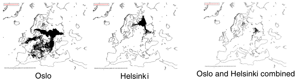
Figure 2. Probabilities of possible emission locations at 07 UTC on 15 of March 2015 to reach Oslo (left) and Helsinki (middle) derived from inverse SNAP runs. The right hand picture gives the combined probability.

from the SNAP model particles which were 24 h old, were used as emissions in the Eulerian model. This conversion from SNAP model to EEMEP was repeated at every hour. The EEMEP model was run for 40 h, starting 24 h after the SNAP model and the final forecast was available after 64 h from the release start.