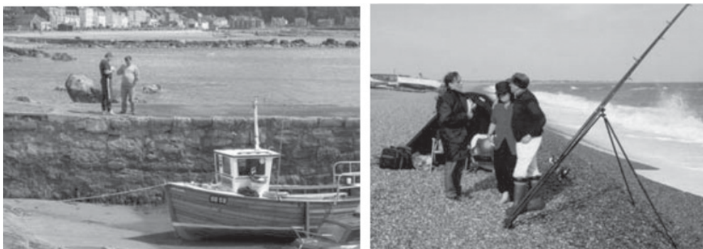
Figure 1. Interviewing fishermen and anglers.