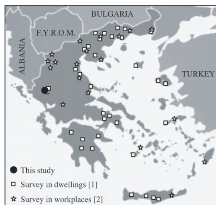
Figure 1. A map showing the sampling location of the present study. The area has scarcely been included in previous investigations of indoor radon.

study carried out in 561 workplaces in other parts of the country [2]. All radon concentration values were found to be below 400 \text{ Bq m}^{-3} , which is the action level implemented for workplaces by the Greek Radiation Protection Regulations, following the EC recommendation [5].